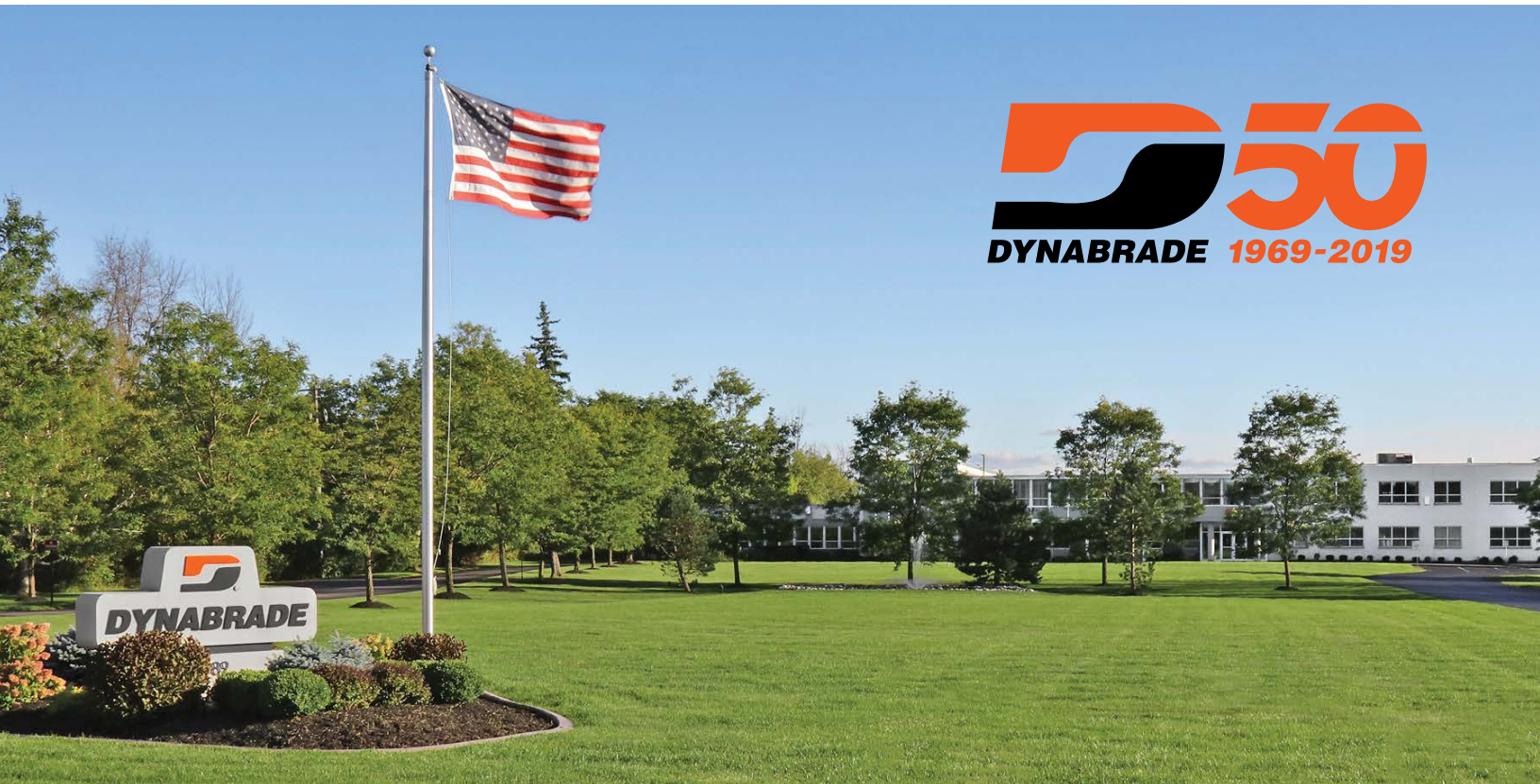
Current Dynabrade Catalog